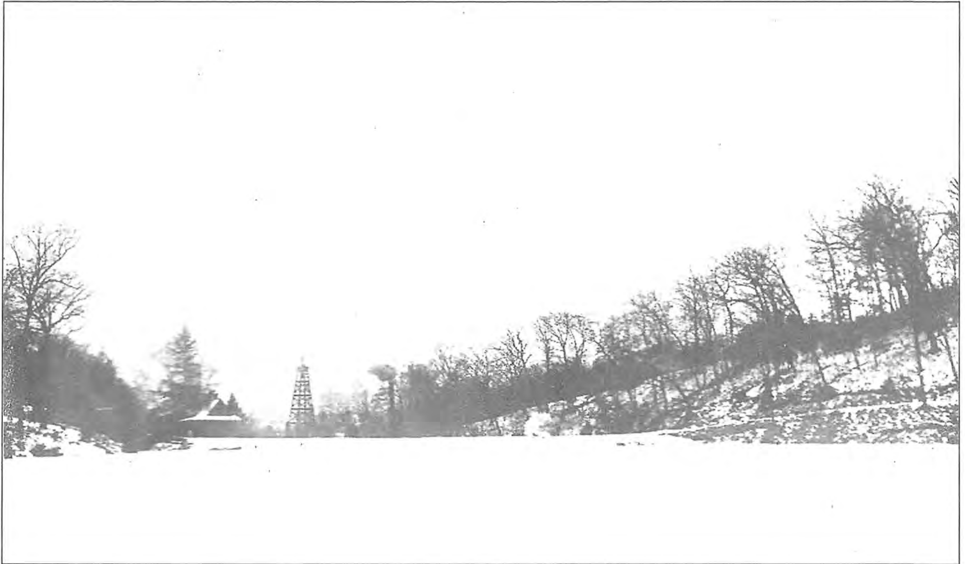
Assumed to be a view of McDonald Dam, Circa 1918 Bavington, PA