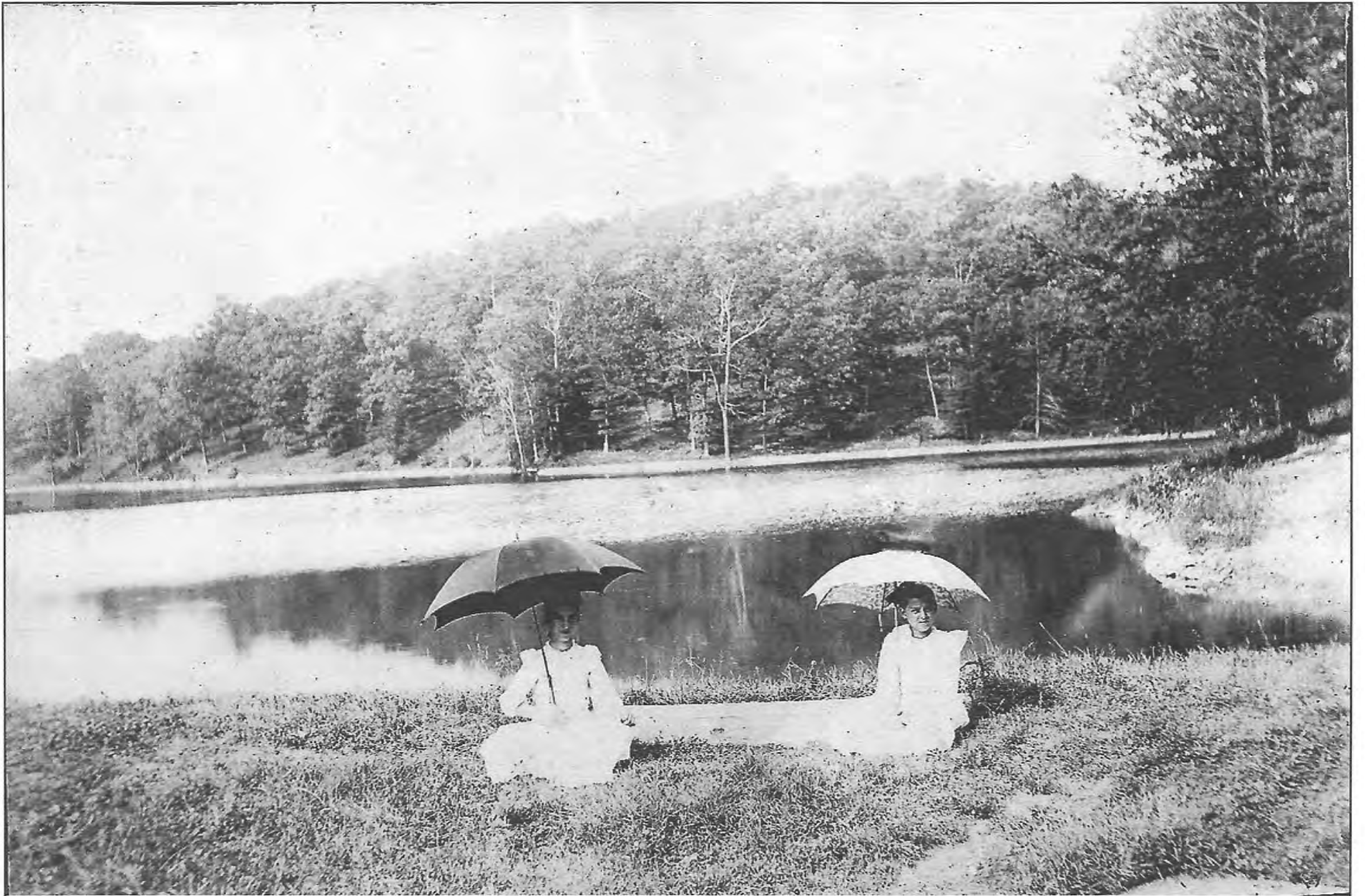
View of McDonald Dam Bavington, PA