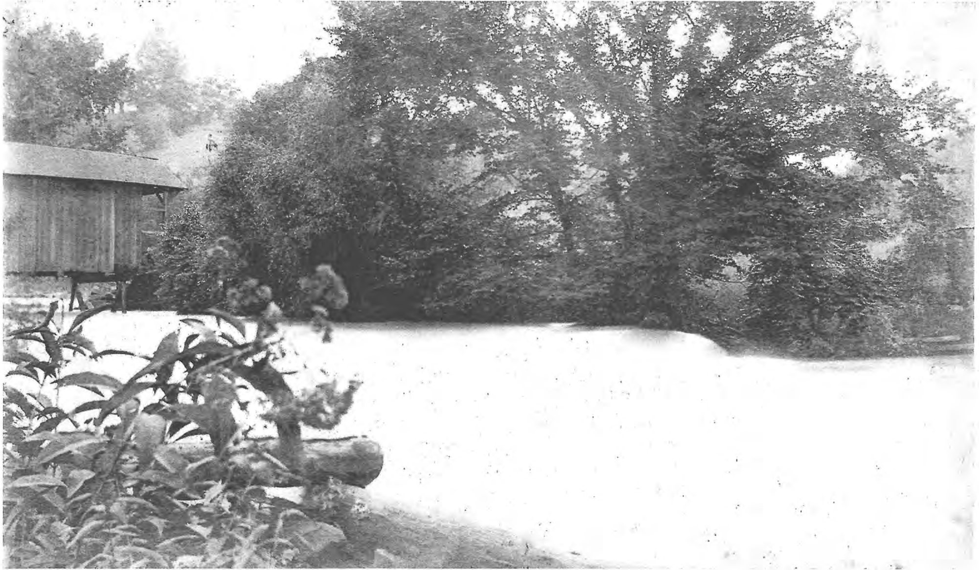
1896 Flood-Bridge and mill dam on Big Raccoon Creek, Bavington, PA