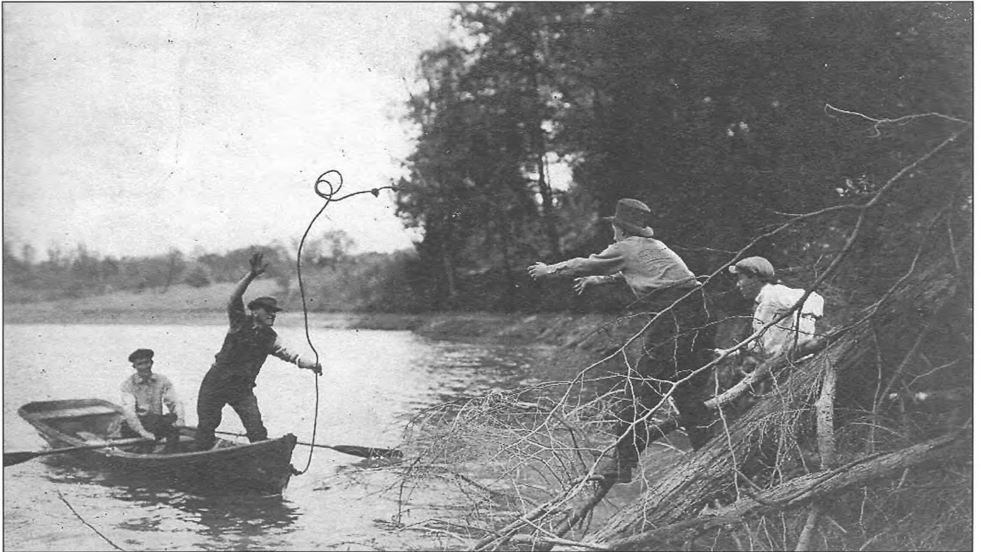
View of Men fishing, assumed to be McDonald Dam Bavington, PA