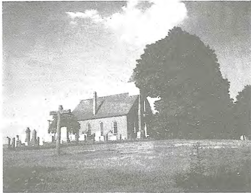
BETHEL METHODIST CHURCH