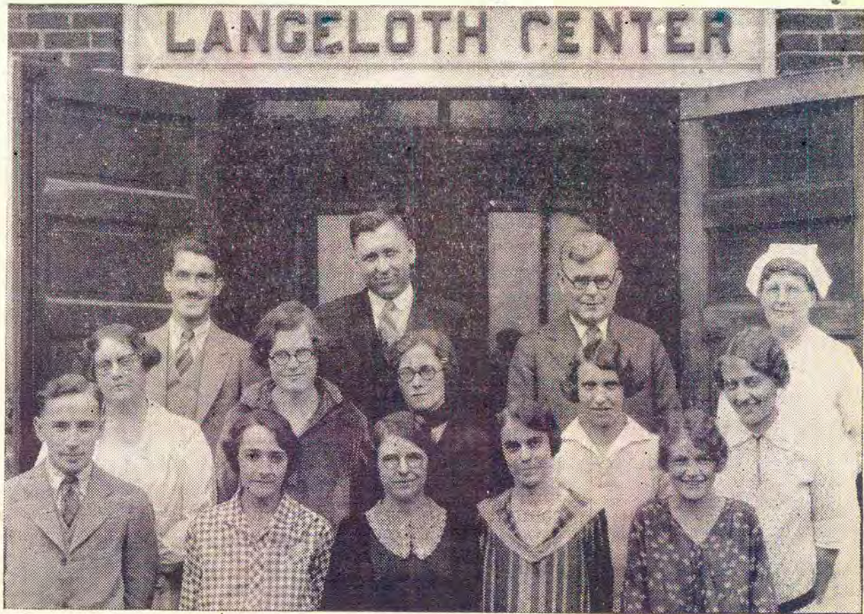
Our Boys in Service will remember Langeloth Teachers of 1929 in the above picture.