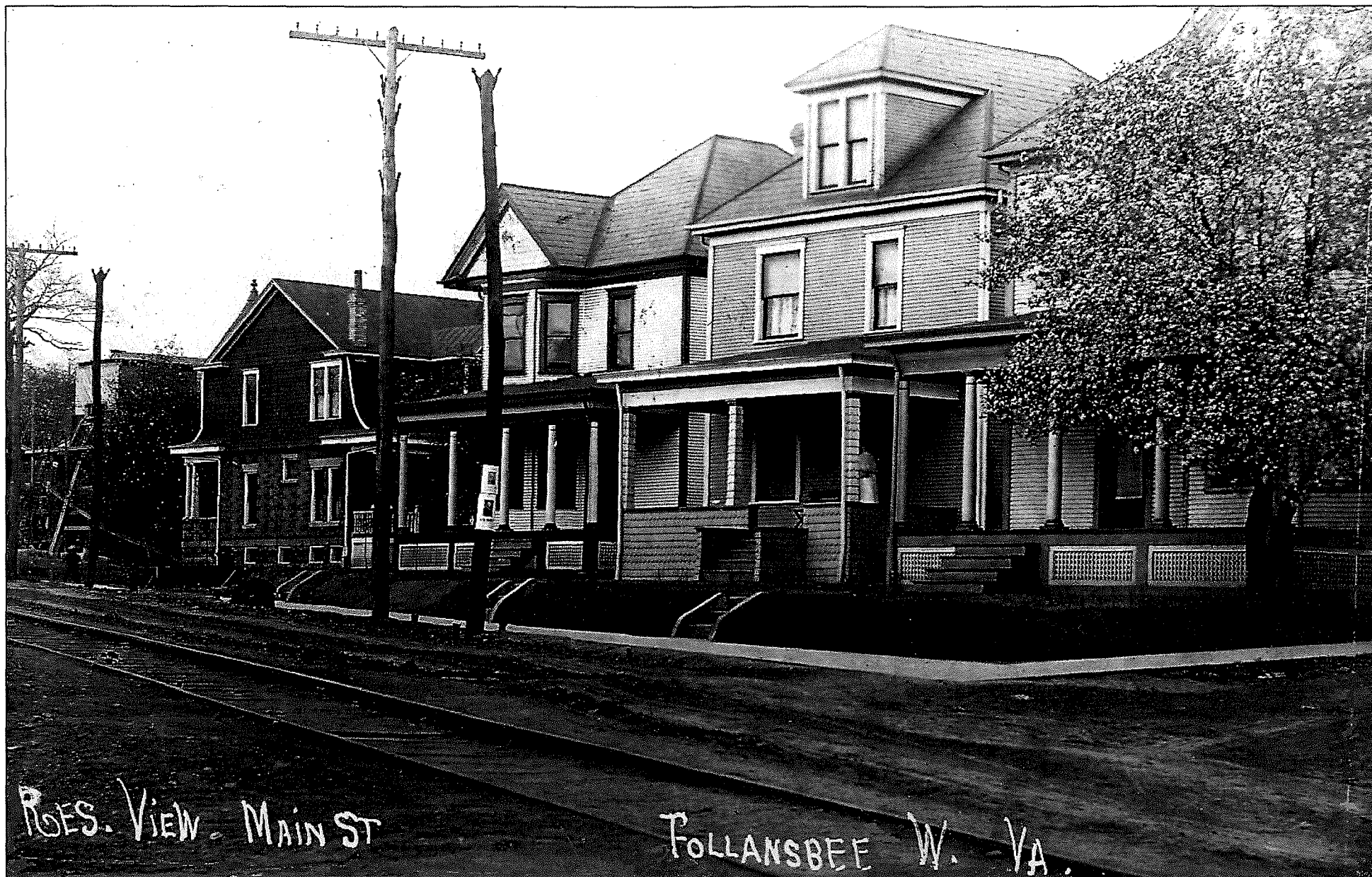
Residential View of Main Street, Follansbee, WV Post Card Mailed-1910